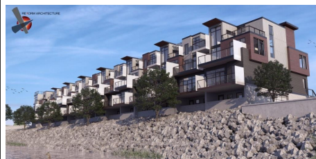
4 The Waterfront 15 Townhomes Spring 2017 Occupancy