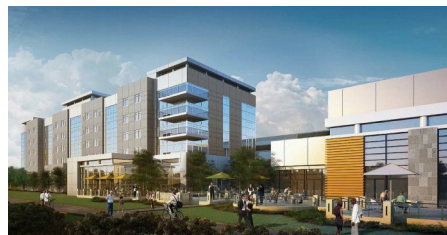
10 Nationally Recognized Hotel 163 Rooms Spring 2017