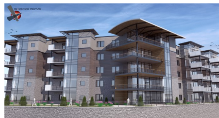
5 Harbor Point 50 Condos TBD