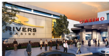
11 Rivers Casino Under Construction Early 2017 Opening