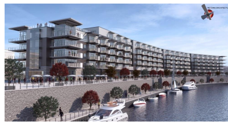
6 The Riverhouse 206 Apartments 45,000 SF Retail Under Construction Early 2017 Occupancy