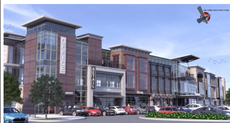
1 Office/Retail 13,000 SF Retail 26,000 SF Office Spring 2017 Occupancy