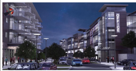
2 Office/Retail 21,820 SF Retail 40,025 SF Office Under Construction Spring 2017 Occupancy