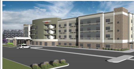
3 Courtyard by Marriott 124 Rooms Opening Fall 2016